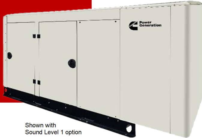
Shown with Sound Level 1 option