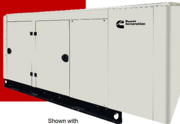
Shown with Sound Level 1 option